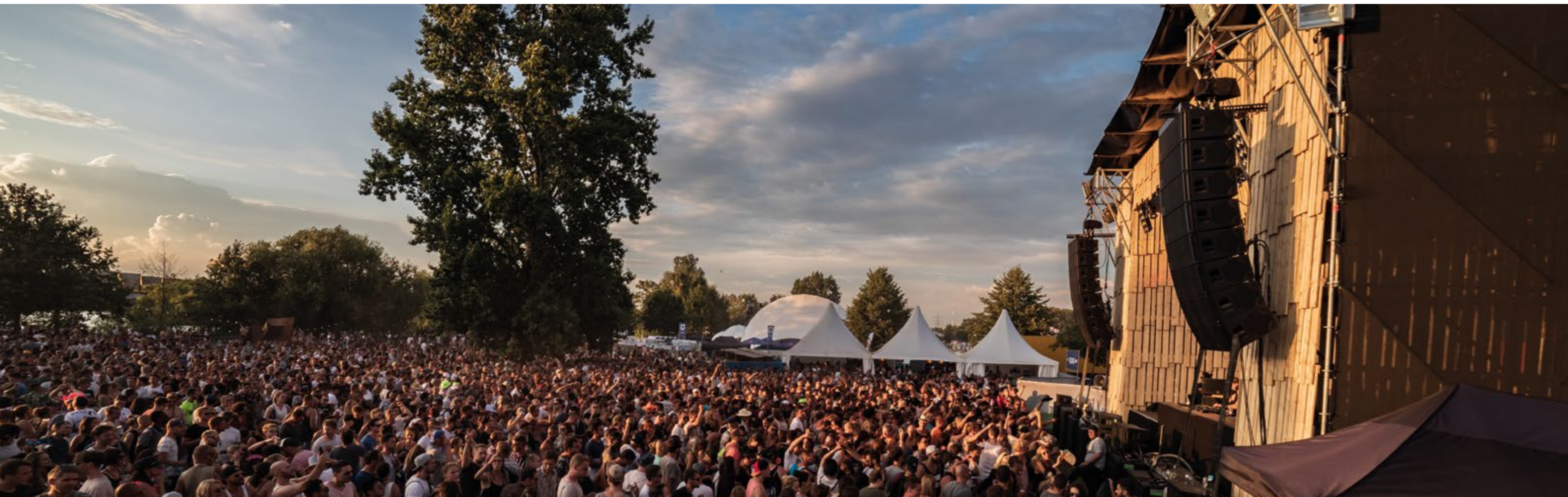
KSL for Love Family Park, Rüsselsheim am Main, Germany