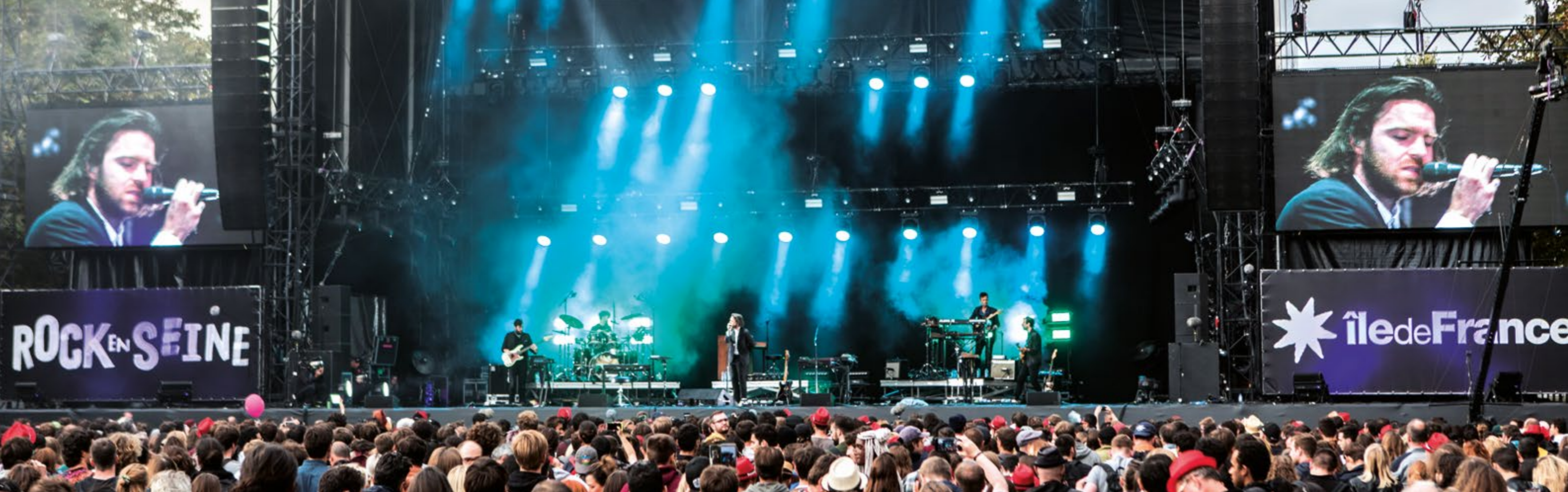
KSL for Rock en Seine Festival, Paris, France