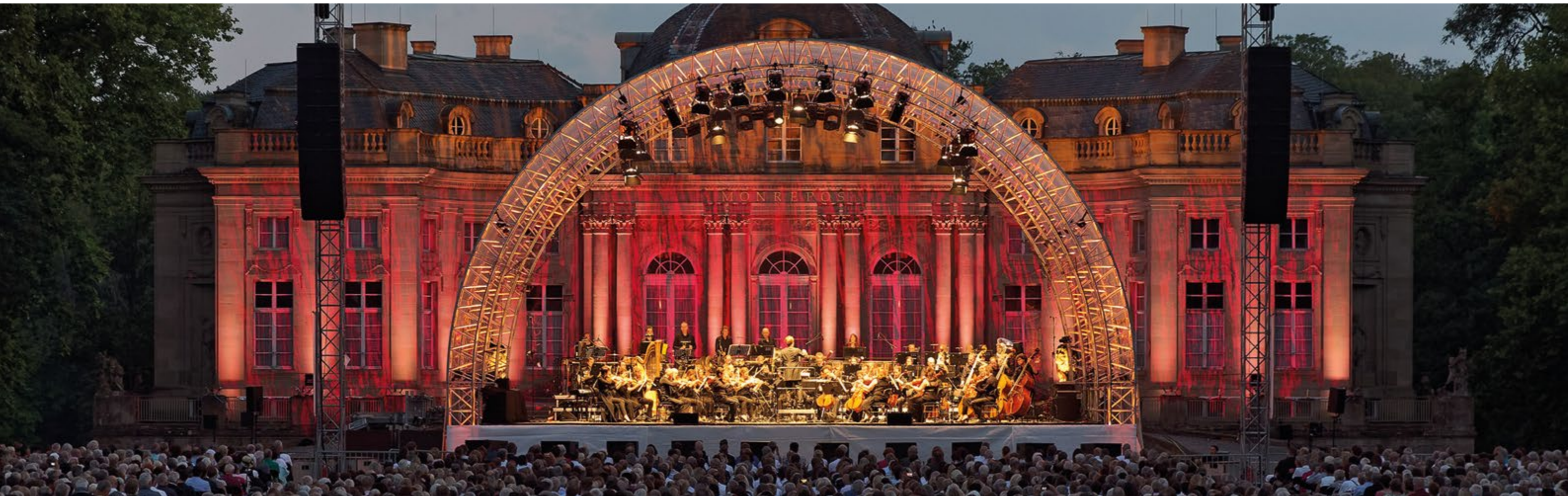
KSL for Klassik Open Air Monrepos, Ludwigsburg, Germany